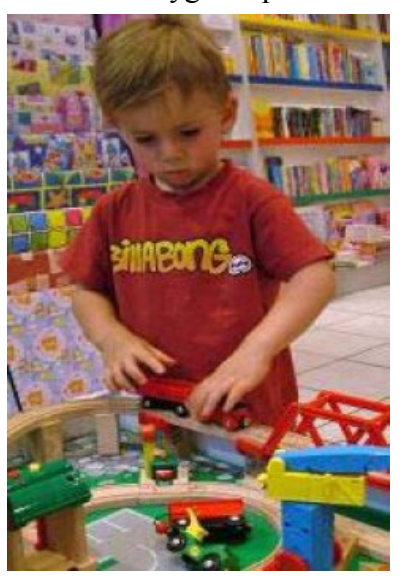
Table 2 shows that worn goods were involved in the greatest number of incidents, followed by "other" goods (e.g., petroleum gas tanks, toys, tools, shoe polish, CD sleeves) and pharmaceutical medicines/hygiene products.<sup>5</sup>